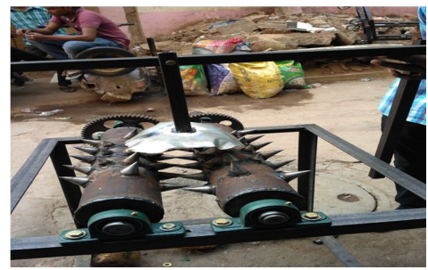
Fig.5: Assembly of Mechanical Parts

Frame is stable structure it weights all the other parts of machine. The frame can hold approximately 100kgs. Then rollers which are welded with spikes which is about 10kgs each. The gears are inserted into the shaft. The gears are tightly fixed using screw between shaft and gear. And it is fixed using L angle tool. The each gear is fixed to each shaft tightly. Now the ball bearings are fixed on the frame by using nut and bolt using different screw drivers, the four bearing are used for four sides. The shafts are inserted into the ball bearing such that meshing of gears can happen easily. The shaft are are inserted in the bearing are fixed by using L angle tool. To the large length of shaft a handle is arranged such that it is easy for rotation. A nut and bolt fitting is there in between shaft and handle. Holder is fixed in the middle part of the one side of the frame. It is a simple holder which is movable up and down. Thus the assembly of the machine a clear assembly can be seen below.