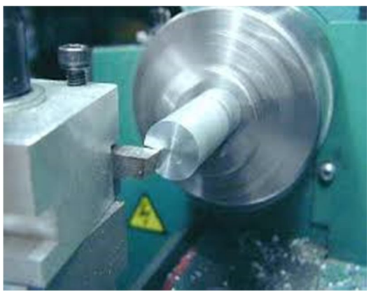
Fig.3: Facing Operation

Facing is a lathe operation in which the cutting tool removes metal from the end of the work piece or a shoulder. Facing is a machine operation where the work is rotated against a single point tool. A work piece may be held in a 3, 4, or 6 jaw chucks, collets or a faceplate.