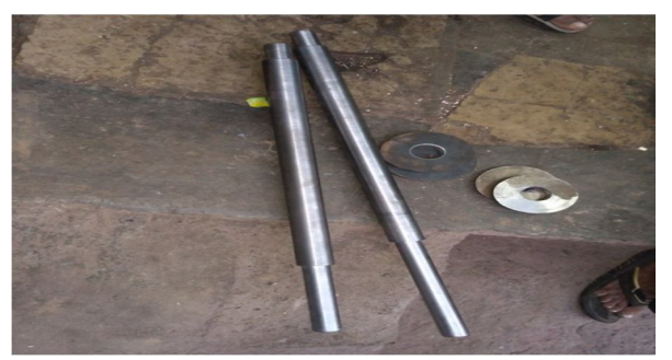
Fig.4: Cylindrical Solid Shaft