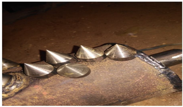
Fig.4: Grinding Operation

Grinding is an abrasive machining process that uses a grinding wheel as the cutting tool, is capable of making precision cuts and producing very fine finishes. The grinding head can be controlled to travel across a fixed work piece or work piece can be moved while the grind head remains in a fixed position.